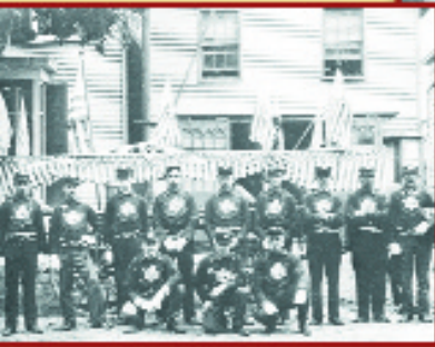
1869: Engine Company in front of newly built Wall Street Engine House.