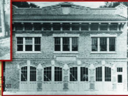
1993: 150th Anniversary Celebration of the Huntington Fire Department.