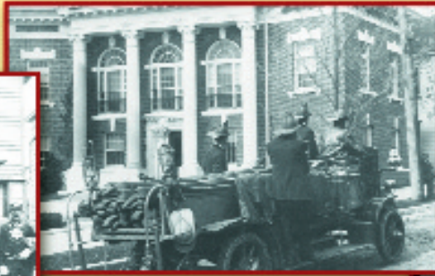
1910: First motor driven apparatus Grabowski Hose Truck heading east on Main Street past the old Town Hall.