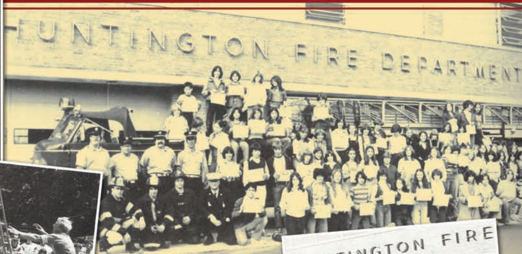
American LaFrance Fire Engine 1947.