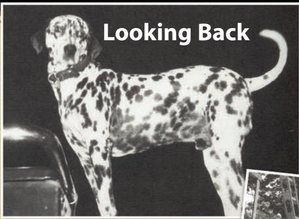
"Buttons" Huntington Fire District Mascot from 1948 to 1959.